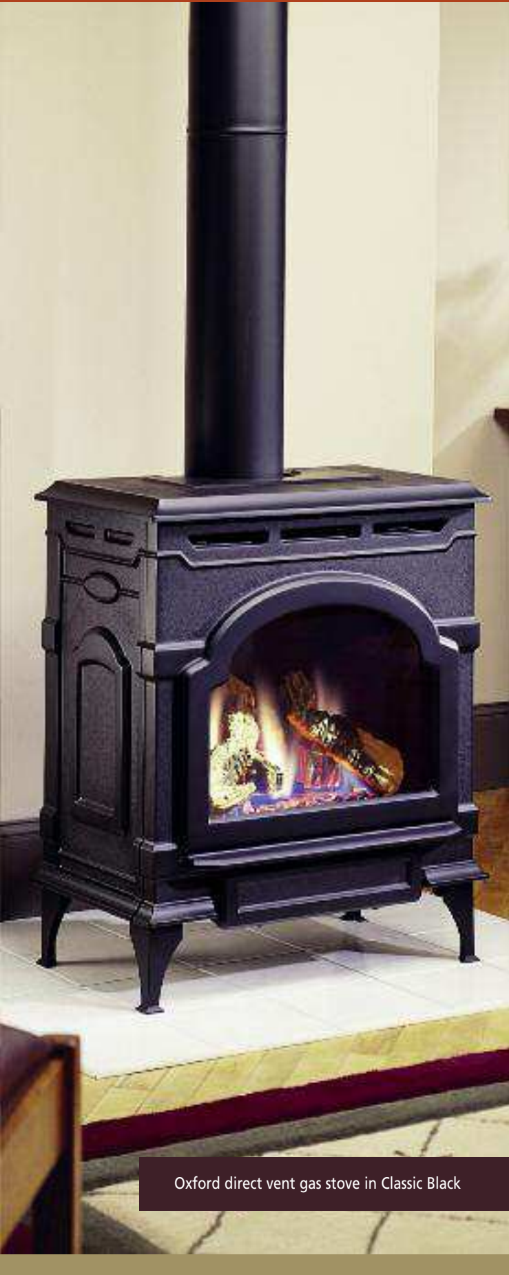
Oxford direct vent gas stove in Classic Black