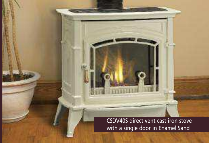
CSDV40S direct vent cast iron stove with a single door in Enamel Sand

Nothing invites or delights like the dancing flames of a fire. For thousands of years fire has been the focal point of hearth and home and, like so many families before, we invite you to sit by ours and enjoy their warmth and beauty.