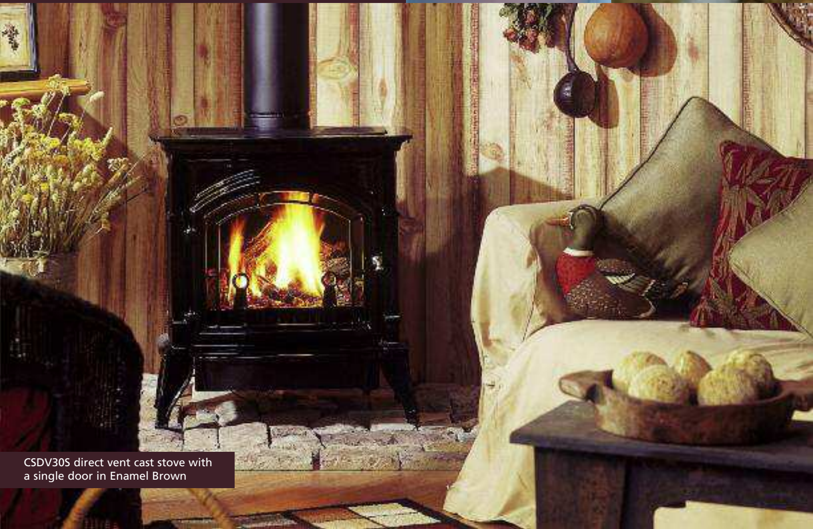
CSDV30S direct vent cast stove with a single door in Enamel Brown