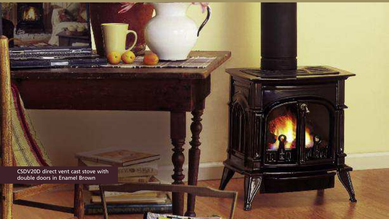
CSDV20D direct vent cast stove with double doors in Enamel Brown