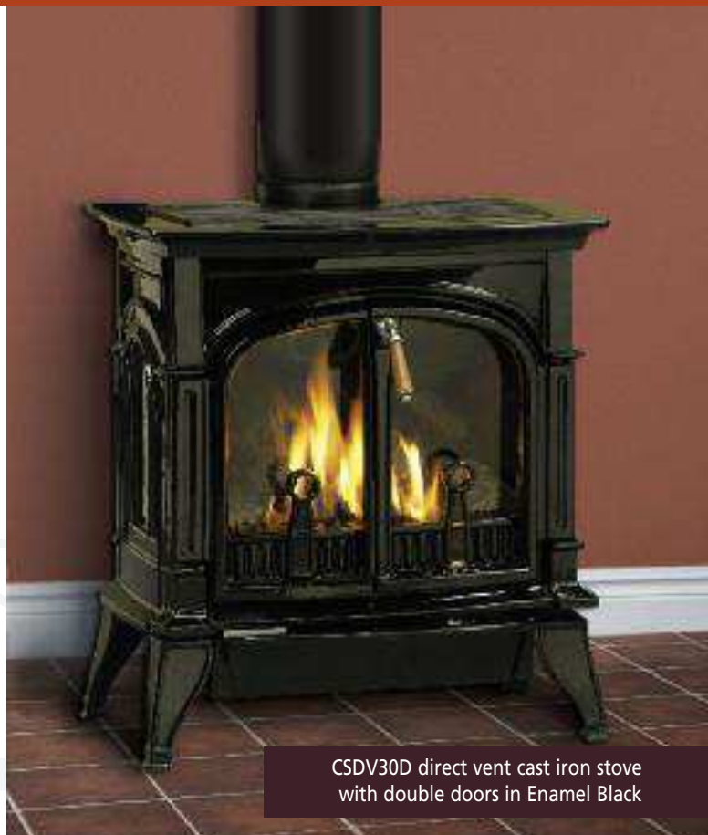
CSDV30D direct vent cast iron stove with double doors in Enamel Black

CSDV30D direct vent cast iron stove with double doors in Enamel Black shown on cover